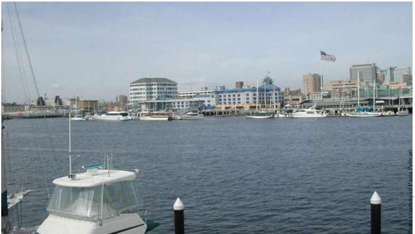
View from Alameda to Jack London Square, one-half mile away

Our mission is to find effective, economical transportation alternatives across the estuary, between Alameda’s West End and Oakland, and help get them implemented.