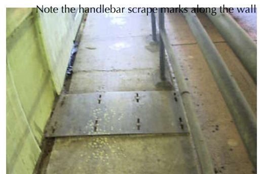
Slippery metal plates on the surface